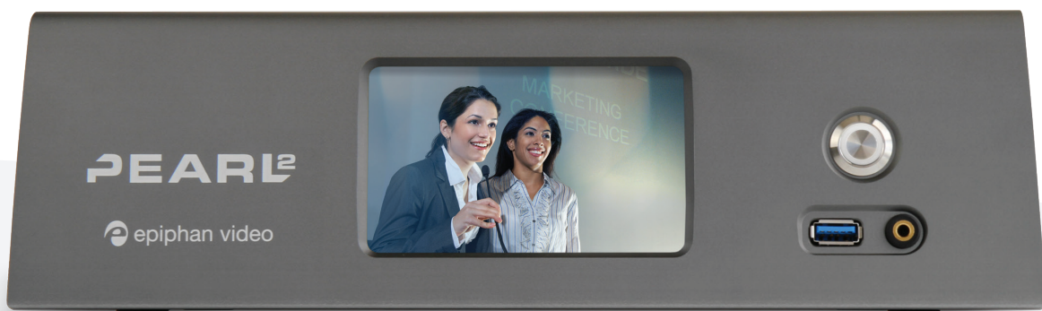
Pearl-2, desktop version For portable live production

Visit epiphan.com/pearl-2 for more information.